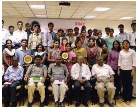
Contestants at Coimbatore