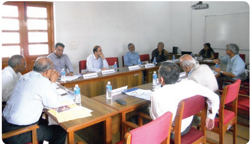
The Team on General Structure of PGDM curriculum in discussion