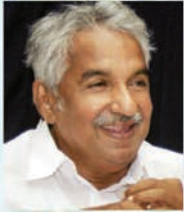
Shri Oommen Chandy