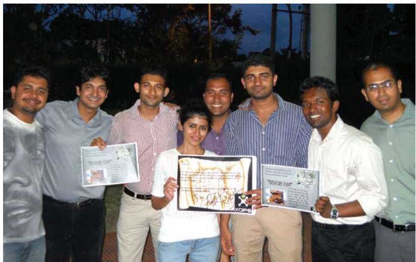
Operations Club organizing the Treasure Hunt

Finitiative conducted a virtual stock market game called "Bull's eye". The event aimed at giving the students an insight in to the day to day trading that goes on in the stock market and also at the same time encouraging them to come up with their own analysis for the investment decisions taken by them.