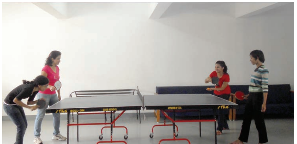
XIME students in a competition

The project forms an integral part of the PGDM course completion. The 140 students presented their learnings from their stint in organizations in varied industries. Some of the places where the students interned include RBI, Tata Steel, Volkswagen, Reliance Telecommunicatins, Edelweiss, HDFC Bank etc.