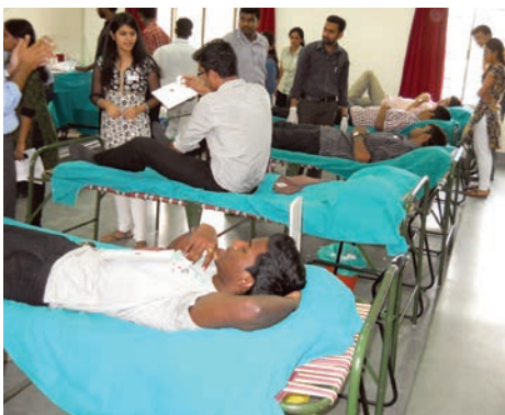
Students in the Camp

A blood donation drive was organized on October 20 2011. The students of batch 16 and batch 17 of the management institute coordinated in taking forward the event on a