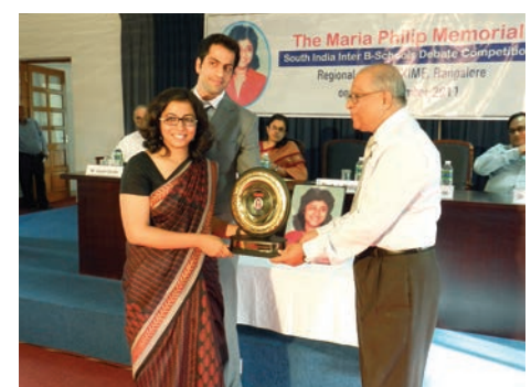
Winners at Bangalore