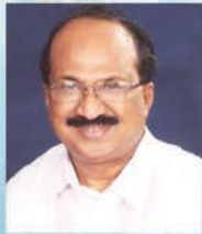
Prof. K.V. Thomas