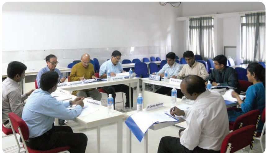
The Team on Economics and Related Subjects deliberating