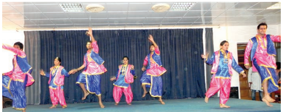
A scene from the Cultural Show