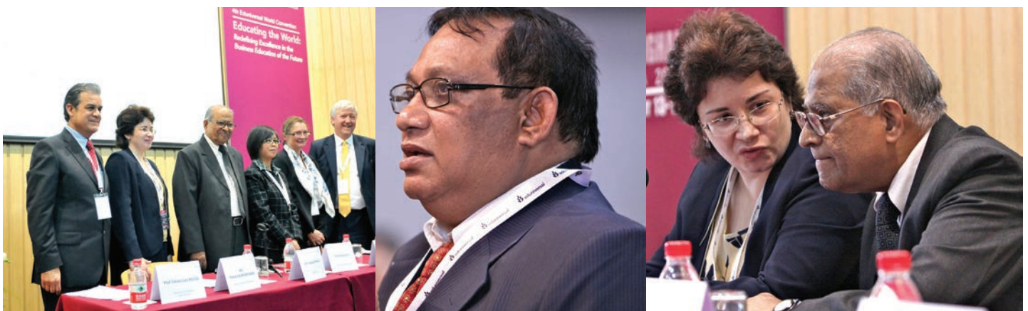
Scenes at the 4th World Convention of Eduniversal at Shanghai during 13-15 October 2011