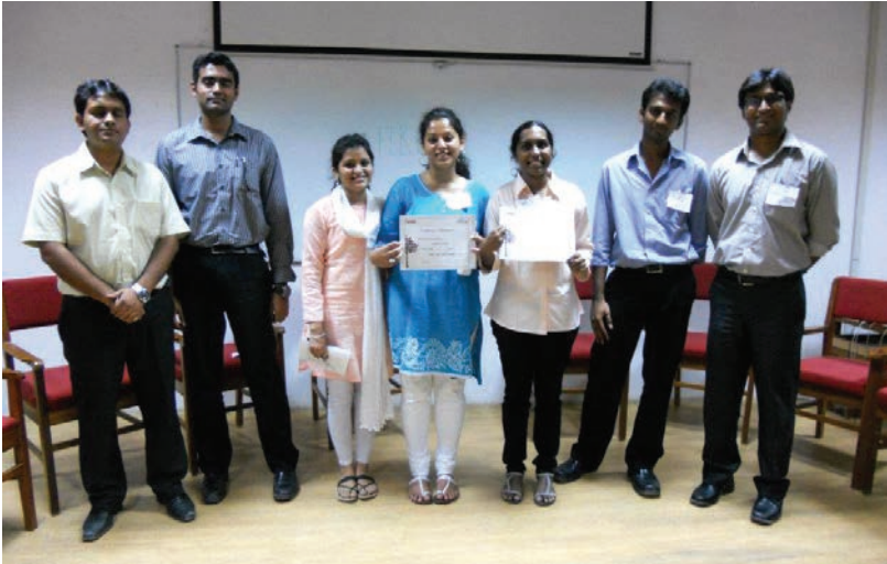
Winners of Finance Club Competition

The second event was called “Beg, Borrow or Steal”. The event aimed at generating an interest for finance stream among the first year students.