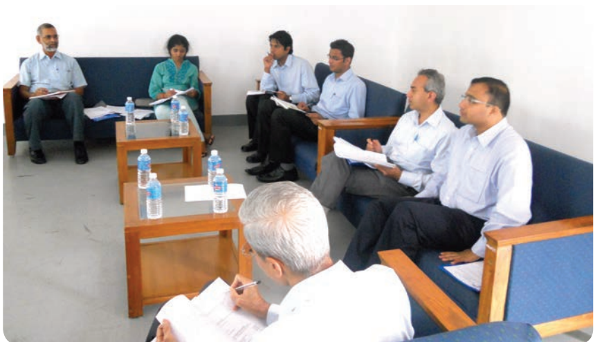
The Team on Finance reviewing the curriculum