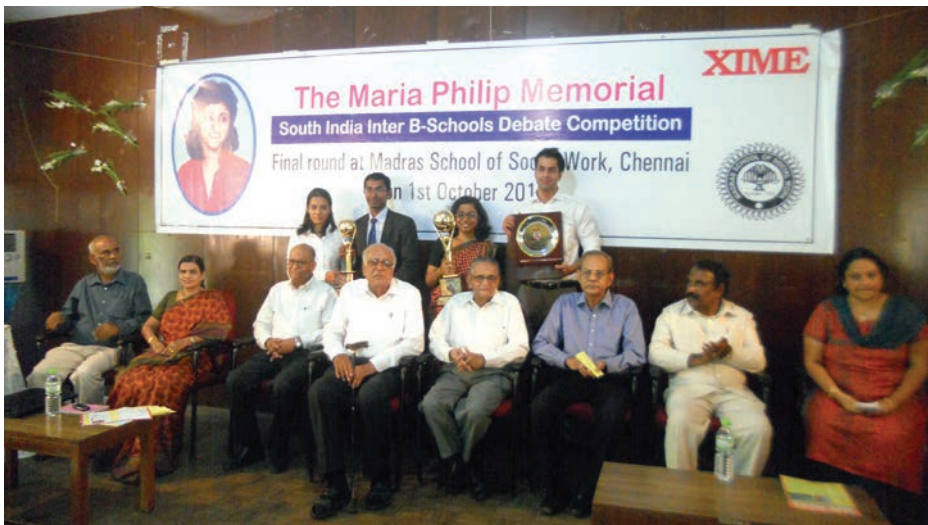
Winners and Runners-up of the finals with dignitaries on the dais

GRG School of Management from Coimbatore, and MACFAST, Thiruvalla and SCMS, Aluva from Kerala.