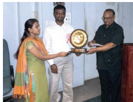
Winners at Secunderabad