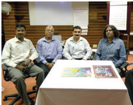
Delegates of ACL Program from SAIL after a leadership task

A tutor development workshop on "Action Centred Leadership" was organised for Steel Authority of India Limited (SAIL) trainers. The program was a four day tutorial program held from 5 Sep 2011 to 8 Sep 2011 at Management Training institute, Ranchi. The program was intended as a Faculty Development Workshop to prepare existing trainers for training in leadership. A total of 14 middle level managers to senior level managers from various organizations such as Alloy Steel plant, Durgapur, ISCO, Behanpur, Bhilai Steel Plant, Salem Steel Plant and MTI SAIL.