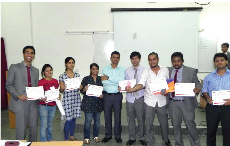
Winners of the Marketing Club Competition