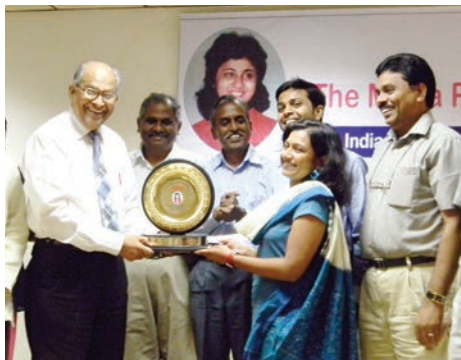
Winners at Coimbatore