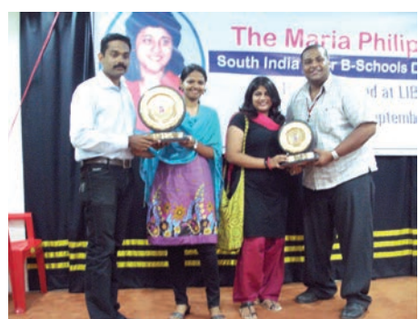
Winners at Chennai