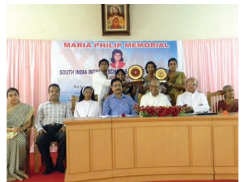
Winners at Changanassery